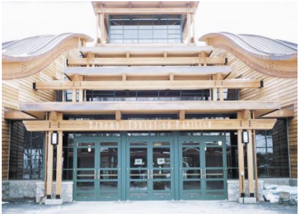
The Deramus Educational Pavilion - Main Entrance

T he Deramus Educational Pavilion of the overhauled Kansas City Zoo opened in December of 1995.