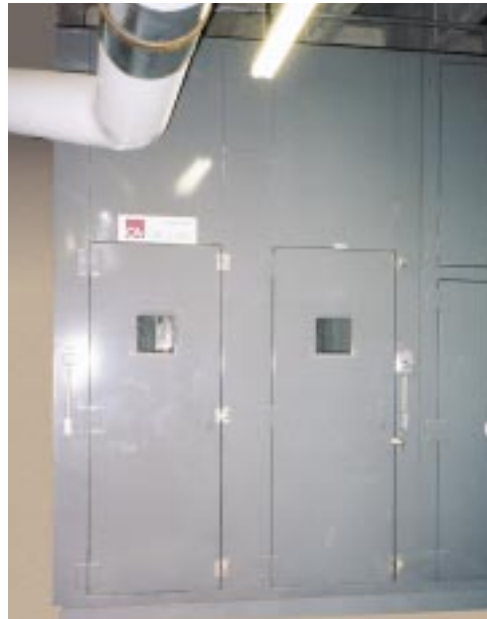
Circul-Aire Model: DAS-1010-SP

The maintenance of the air handling unit has also been simplified with the Tech-Chek Service supplied by Circul-Aire. With this exclusive service, media samples are tested in order to verify consumption rates. This lifetime service is monitored by a computerized program from Circul-Aire that indicates the appropriate schedule for media replacement. The laboratory analysis, supplied at no additional charge, not only provides a precise maintenance schedule but also ensures the highest performance of the air handling system installed at the Kansas City Zoo.